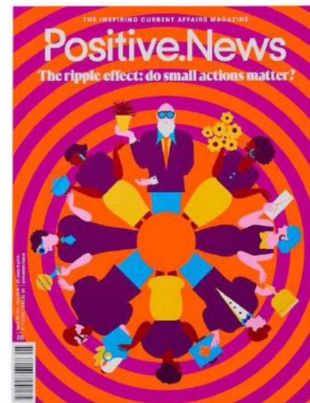
Positive News 2025 new year edition – double page feature due in January 2025.