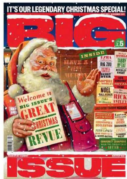
Big Issue 2024 Xmas Special double page feature on progress of our recruits since launch.