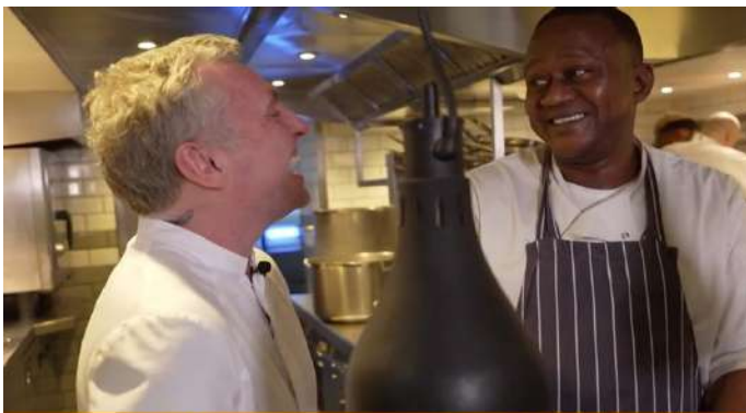
THE UPSIDE LONDON RESTAURANT SERVING UP SECOND CHANCES