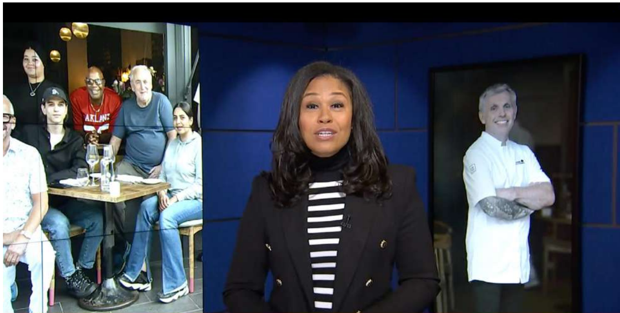
MEAGAN FITZGERALD | NBC NEWS INTERNATIONAL CORRESPONDENT