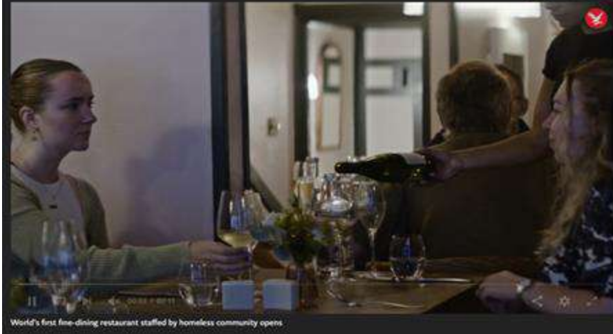
World's first fine-dining restaurant staffed by homeless community opens