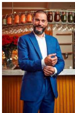
Xmas special on Home Kitchen: Fred Siriex paying a visit to find out what we are all about is to be shown on Dec 13 th 2024